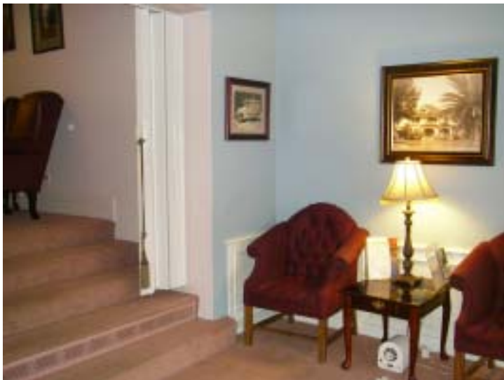
In the lobby is a picture of the 100 year old building next to the original front steps.